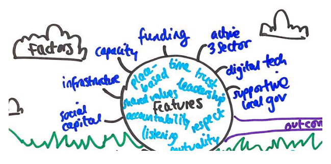
Figure 2: Features and Factors of effective collaboration

achieved in different contexts, particularly those where certain 'ingredients' may be missing or difficult to find and there are barriers to collaboration. For example, what 'trust' means or how it is experienced might depend on where we are geographically, who we are working with, and with what goals. Likewise, approaches to building trust might depend on whether past relationships exist, how robust they are, the wider networks surrounding them, and the resources and infrastructures available to sustain them. We therefore focused our analysis on 'how' questions: how the features of effective multisectoral collaboration and the factors enabling it might apply to, and be developed within, different contexts. This also highlighted the importance of establishing 'why' collaboration was being pursued, rather than seeing collaboration as a goal in itself.