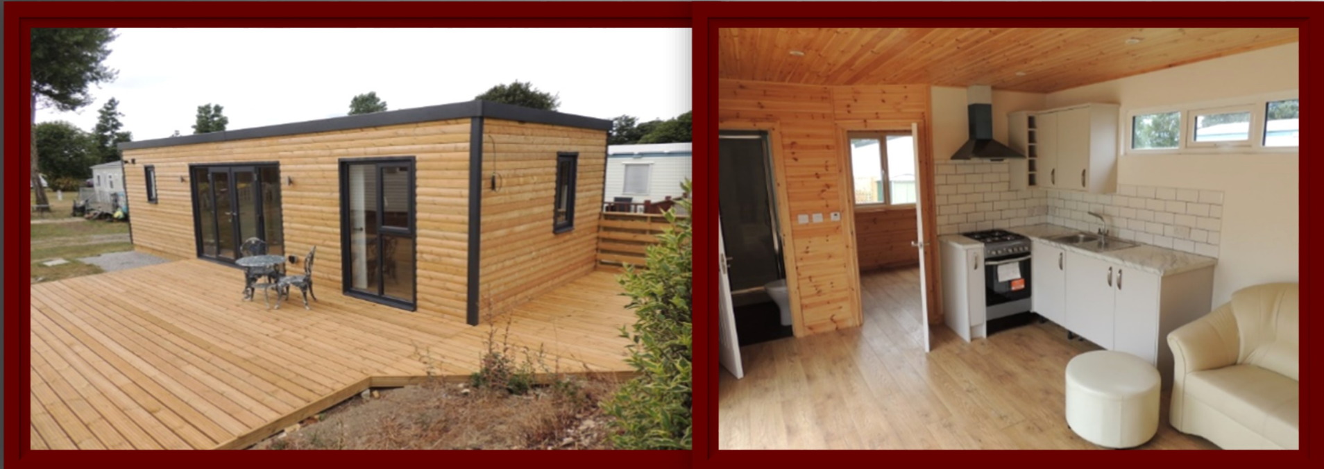
CWTSH Accommodation Units

However, it is in Llanelli, South Wales, that The Wallich homelessness charity plan to take this concept one step further by developing the CWTSH. This innovative supported housing model will provide the first micro village type service to young adults with complex needs who are at risk of homelessness and aims to holistically support service users to prepare for independent community living.